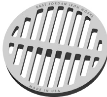
Type M Ductile Iron Flat Grate Approx. 236 sq. in. open area

MATERIAL SPECIFICATIONS Frame — Gray Iron ASTM A48, Class 35B