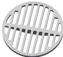
Type M Ductile Iron Flat Grate Approx. 238 sq. in. open area

MATERIAL SPECIFICATIONS Frame - Gray Iron ASTM A48, Class 35B Cover - Ductile Iron ASTM A536 Grate - Ductile Iron ASTM A536